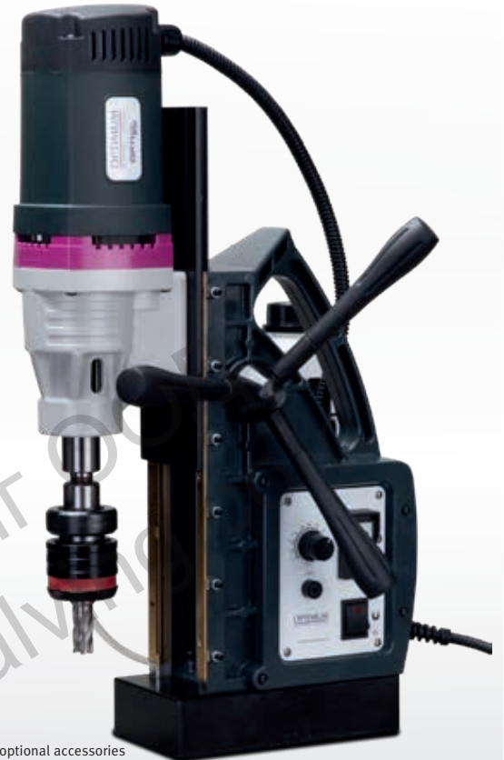
Fig.: with optional accessories