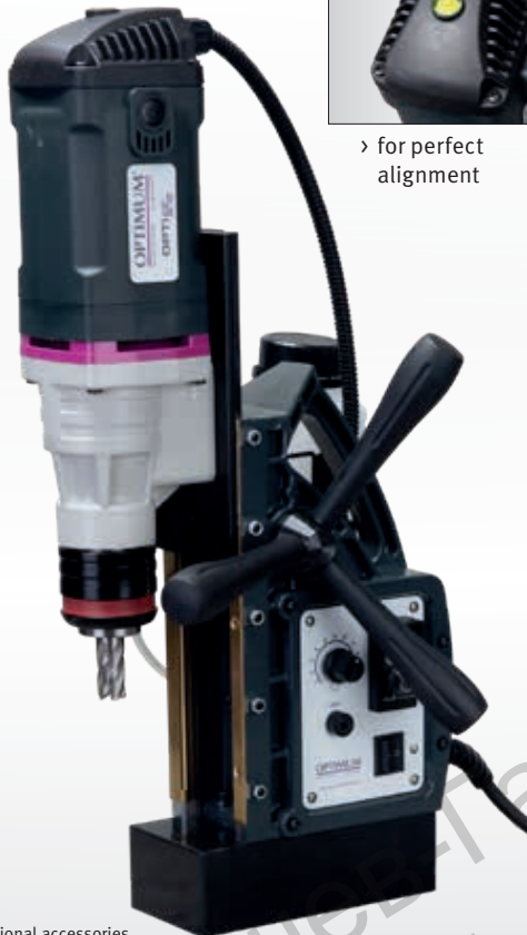
Fig.: with optional accessories